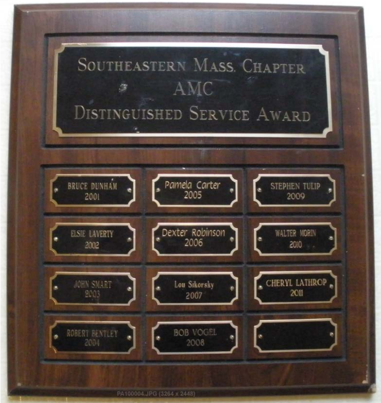
Close-up of first 12 recipients:

This is the physical plaque that was presented to each recipient (on a rotating basis) from 2001-2012. It was replaced by an e-plaque in 2013.