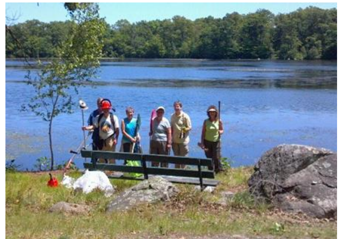
After trail work – note the view from the bench