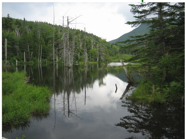
Beaver Pond, Zealand Trail