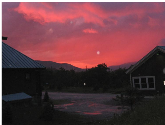
After the Storm, Highland Center