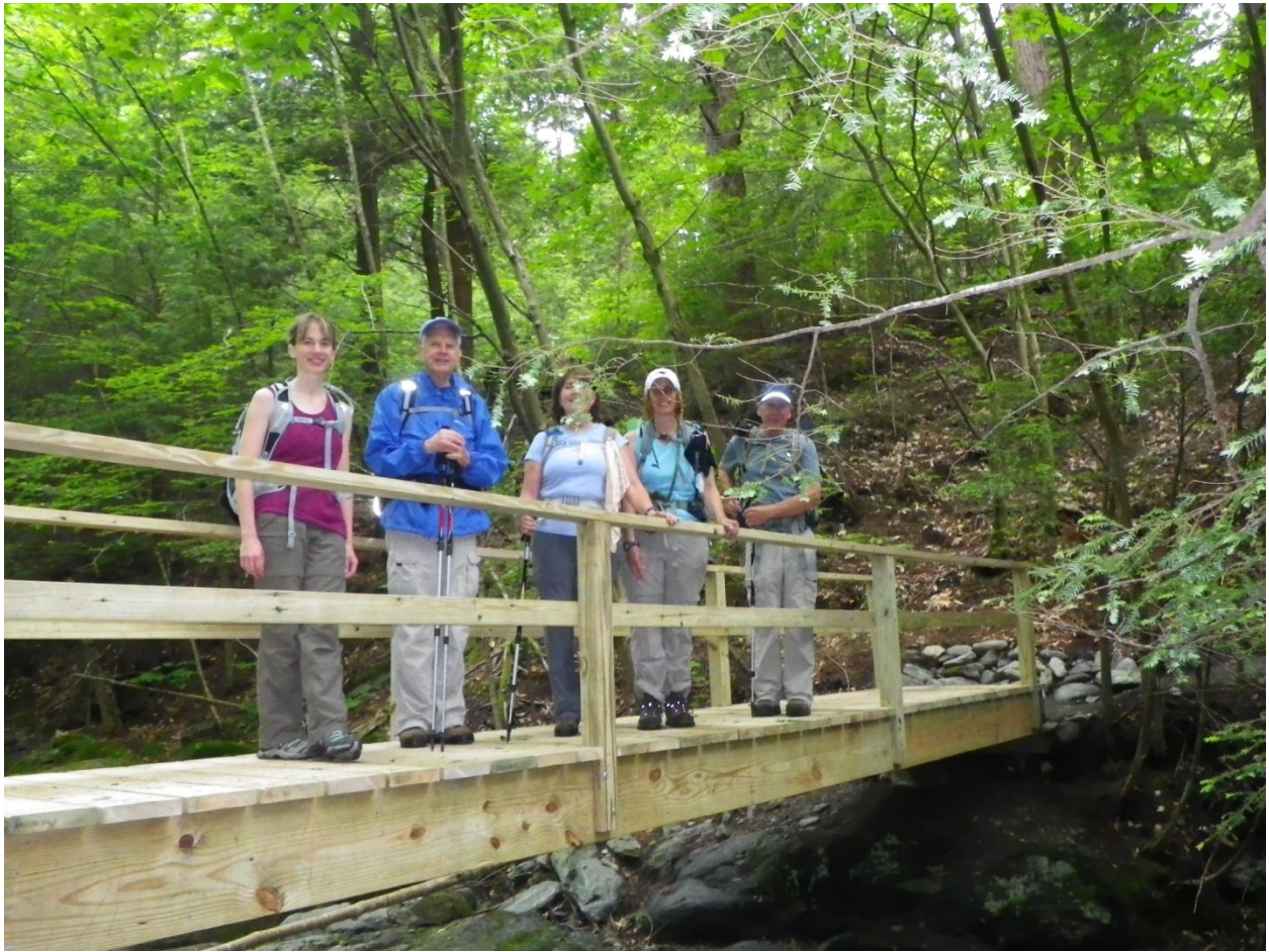
BASH BISH FALLS HIKE - SUMMER 2012