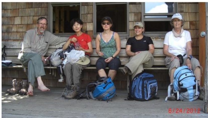
Zealand Hut rest stop

Pictures from June 23 transit hike up Mt Hale to Zealand Hut and return via beaver ponds along Zealand Trail, with Highland Center postscript.