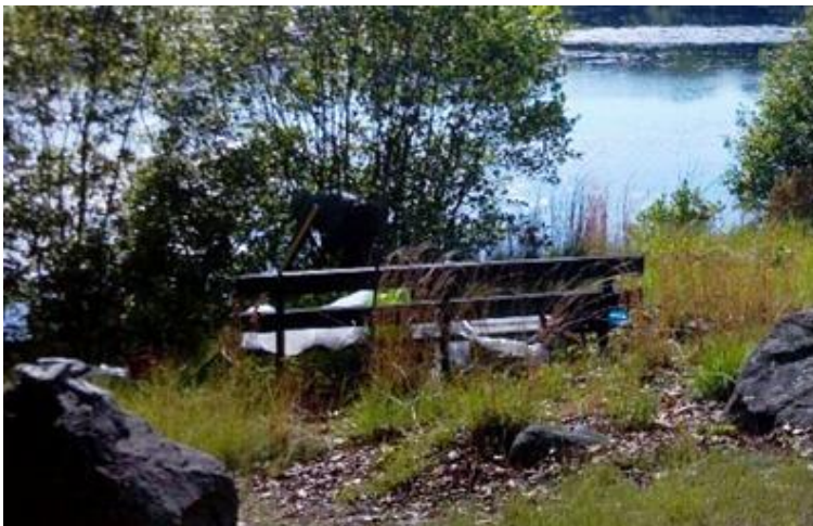
Before trail work – note the view from the bench

stacked the cut brush in neat piles. The hand-tools group, Doug and Marty Griffiths, Becky Strohe, John Plouffe, Jim Plouffe and me came in and cut the smaller shrubs and plants, hauled trash and did the finish work. The area was opened up to views of the pond in 3 places and the visibility from the trail and road were improved.