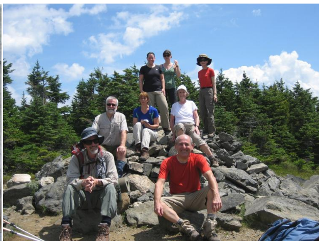
Summit of Mt. Hale