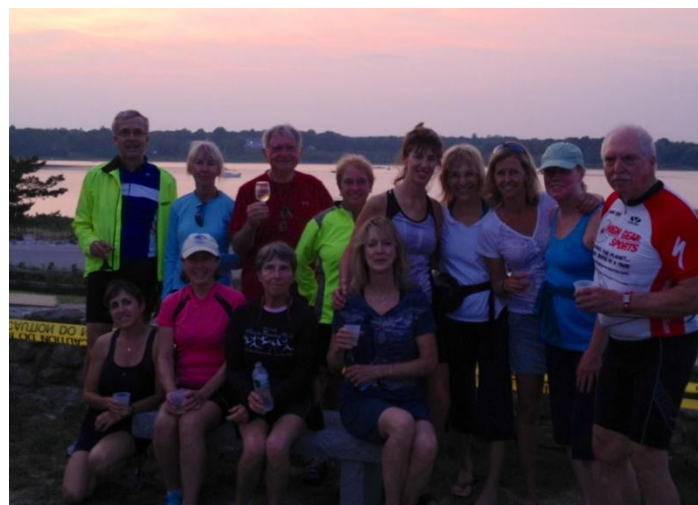
SUMMER SOLSTICE RIDE 2012