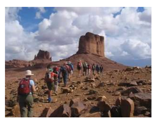
Trek in Morocco