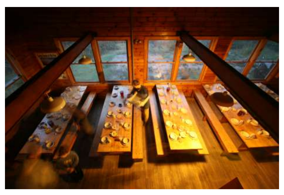
"Flurry of activity at 6 AM" by Christina Han, Connecticut Chapter. Winner of the "AMC in Action" category in the 2011 AMC Photo Contest.

For complete rules and entry instructions, visit <u>www.outdoors.org/photocontest</u>. Entries will be accepted until November 15<sup>th</sup>, with the winners appearing in a spring 2013 issue of AMC Outdoors .