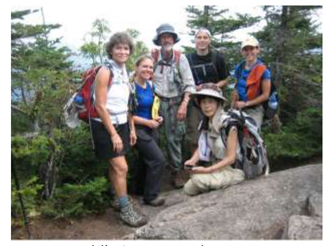
Middle Tripyramid Summit