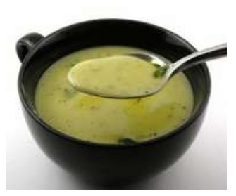
Cream of Zucchini Soup