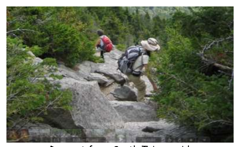
Descent from South Tripyramid