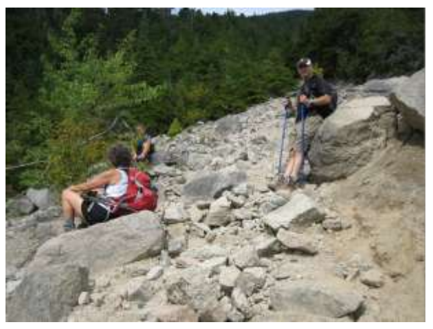
Descent rest stop amid boulders & scree