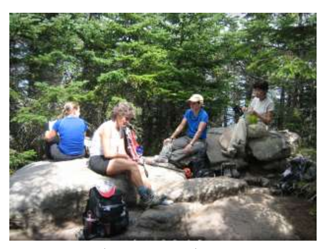
North Tripyramid Summit