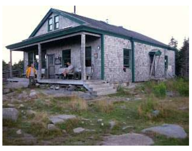
Three day, 25 mile trek across some of the White Mountains most scenic wilderness areas.

YouTube video: <a href="http://www.youtube.com/watch?v=Vudevm3qXvs&feature=plcp">http://www.youtube.com/watch?v=Vudevm3qXvs&feature=plcp</a>