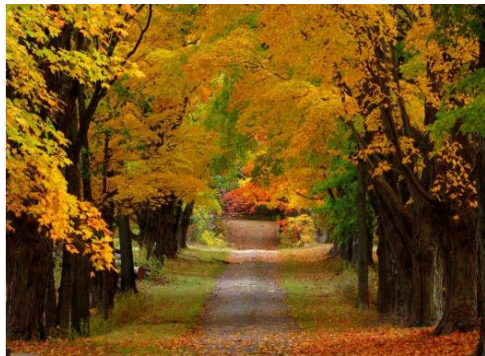
Maple lane in the fall